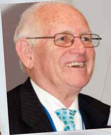
Keynote 1: Wolfgang Kasper